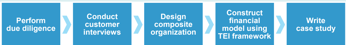
FIGURE 2 TEI Approach

Given the increasing sophistication that enterprises have regarding ROI analyses related to technology investments, Forrester's TEI methodology serves to provide a complete picture of the total economic impact of purchase decisions. Please see Appendix B for additional information on the TEI methodology.